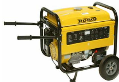
9 000 w with auto idle