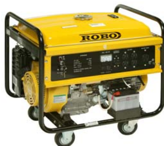
6 500 w with auto idle