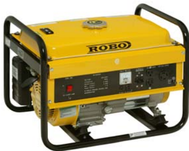
3 000 w